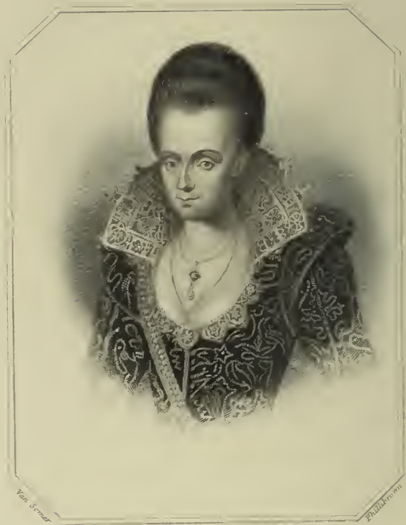
LADY ARABELLA STUART,